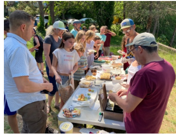
5 th graders at Village School accomplished a phenomenal fundraiser; two bake sales, a raffle, and coin drop raised money to purchase 3 wheelchairs for children in Ecuador.

Thank you to all our donors for changing the lives of more than 200 children, adults and their families, and supporting the salaries and training of staff in Ecuador